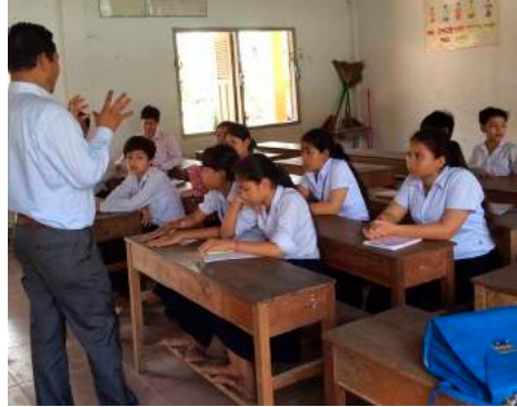
Discussion with Student council members on CRC implementation

On the 31st of December 2015, we monitored the change process and did some follow up on the tasks which were promised by the school principal and all stakeholders. We met the school principal and checked what had happened in the classroom that was reserved for the student council and the development of the different clubs.