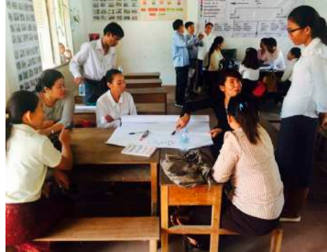
School Principal and teacher discussion on CRC implementation