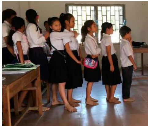
Group discussion among study club and a line to select club of participation